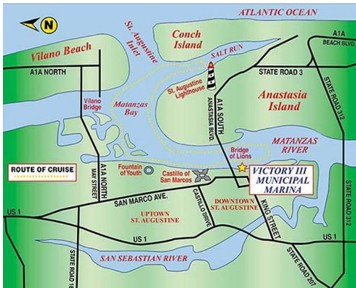
Left: Map of St. Augustine showing the main roads, the Lighthouse, and the city dock where we will board the Victory III .

We would like a representative from each participating or member institution to email us at maritimesymposium@hotmail.com (subject heading: “Institutional Listing” with a brief overview of your institution (3-5 sentences), along with mailing address, website, phone/fax, and contact name. This will appear on the conference program. Thanks!