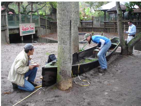
Archaeologists from LAMP and the St. Johns County record a historic canoe at the Alligator Farm. This appears to be the same canoe seen in the banner image above, which was photographed in St. Augustine in the late 1800s.